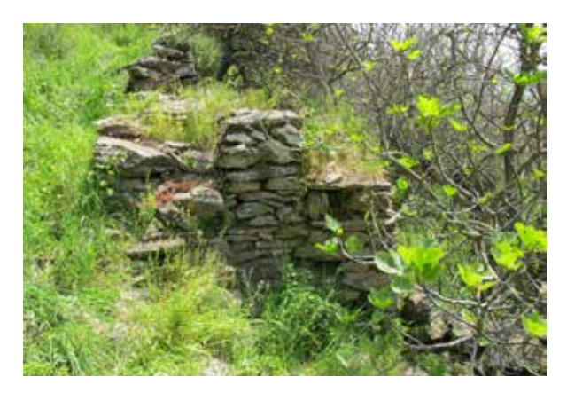
Fig. 2: Remains of the wall