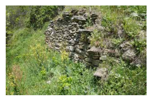
Fig. 3: Stairs (West)

provided access to the main volume. There is a rectangular space on the eastern end, which lies outside of the vegetation (Fig. 1). A rectangular window with a flat lintel and a niche in the wall have survived in this space. Moreover, a door that provides passage between spaces is also noted. There is an original stairway on the southern wall of the terrace above that connects different levels.