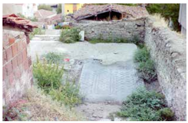
Fig. 6: Tanyeli no.40 Western half of the prayer hall, looking south, terrazzo tiles flooring (1999)

southern walls as well as the tile flooring in the western half indicate that there was a row of timber seating mounted on at least these walls, which is a common feature for such a small-scale building (Fig. 6). Since there are not any entrances despite the beam holes in the northern wall, the women's gallery (if there was one) would have extended along the northern and possibly the western wall, and access would be provided via an outdoor staircase to the south. According to the liturgical requirements of Judaism, every synagogue must have a courtyard. The courtyard of this building might have been to the south and its entrance could have been from the western or southern facades.