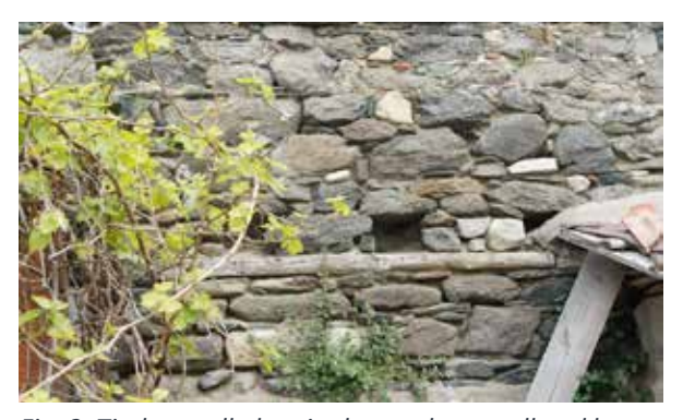
Fig. 3: Timber wall plate in the northern wall and beam holes (2019)