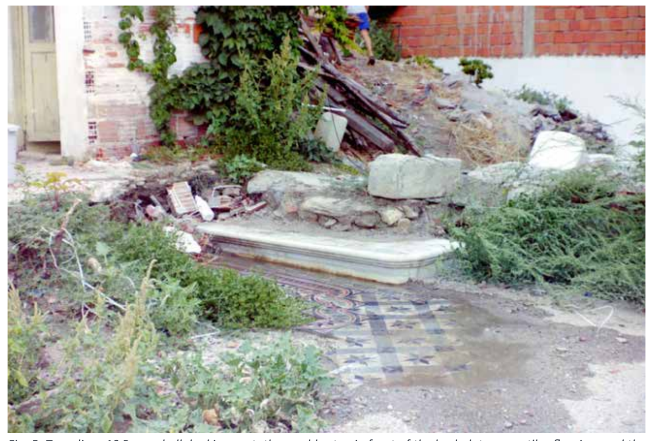
Fig. 5: Tanyeli no.46 Prayer hall, looking east, the marble step in front of the hechal, terrazzo tiles flooring, and the vegetation on the left in the place of tevah (1999)