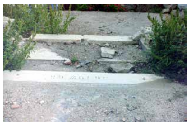
Fig. 7: Tanyeli no. 45 Doorsill with Hebrew inscription (1999)

Within the area defined by the main walls, there are improper additions, rubble filling of varying thickness, and trash brought over from elsewhere. In addition, vegetation covers the