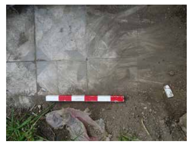
Fig. 4: Details of the terrazzo tiles flooring (2019)

The space of worship can only be evaluated based on the photographs taken by Tanyeli and her team in 1999. According to these, the entrance –with an inscribed doorsill– is in the middle of the southern wall (Fig. 7). There are the traces of the holy ark ( hechal ), where the Torah scrolls were kept, with a marble step in its front on the interior of the eastern wall (Fig. 5). The tevah , which was once in the middle of the space, is surrounded by terrazzo tiles that have geometric and stylized floral patterns (Figs. 5-6). The void between western and