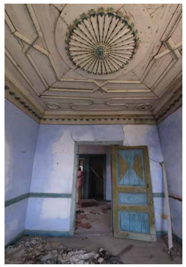
Fig. 8: Southeastern room with decorative ceiling on the second floor

This unregistered building is threatened by neglect. The house should be registered as soon as possible. Although it has a roof, the building is completely exposed to external weathering conditions due to the collapses in its roof structure. The timber ceilings, flooring, and the windows should be cleaned, repaired, and renewed in accordance with their original design. The timber-frame structure should be consolidated as a whole and renewed where necessary. There are undefined spaces that resulted from alterations of