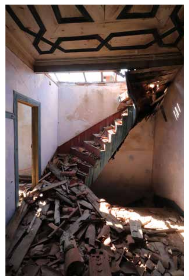
Fig. 7: Second floor sofa and the staircase leading to the roof