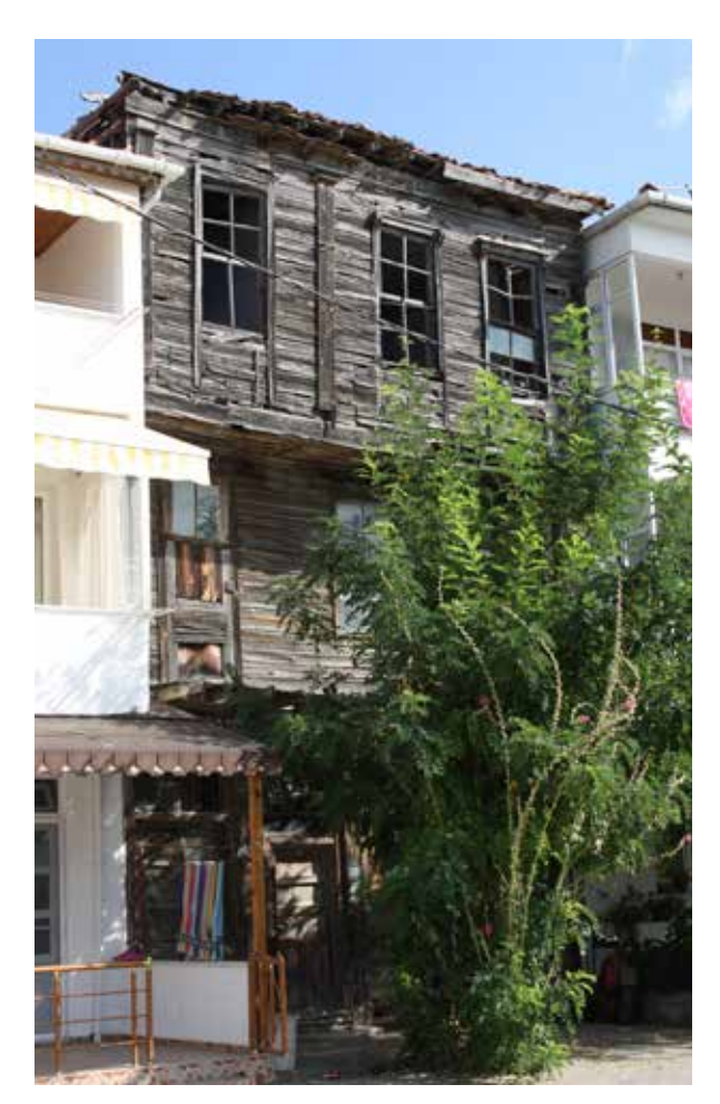
Fig. 2: General view of the southern façade

The first floor of the street-facing, northern façade has a second entrance via a staircase providing access to the upper floors of the neighbouring western building, which was later extended to this side (Fig. 4). This façade was later renovated and altered to a great extent. There are three windows on the northern façade, two of which were later blocked. The northern façade was built with bricks.