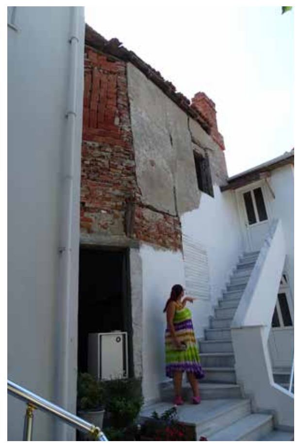
Fig. 4: The entrance from the north façade and the brick wall

Access to the upper floor is currently provided from the eastern corner of the north façade. Both floors have symmetrical plan organization. The entrance from this façade