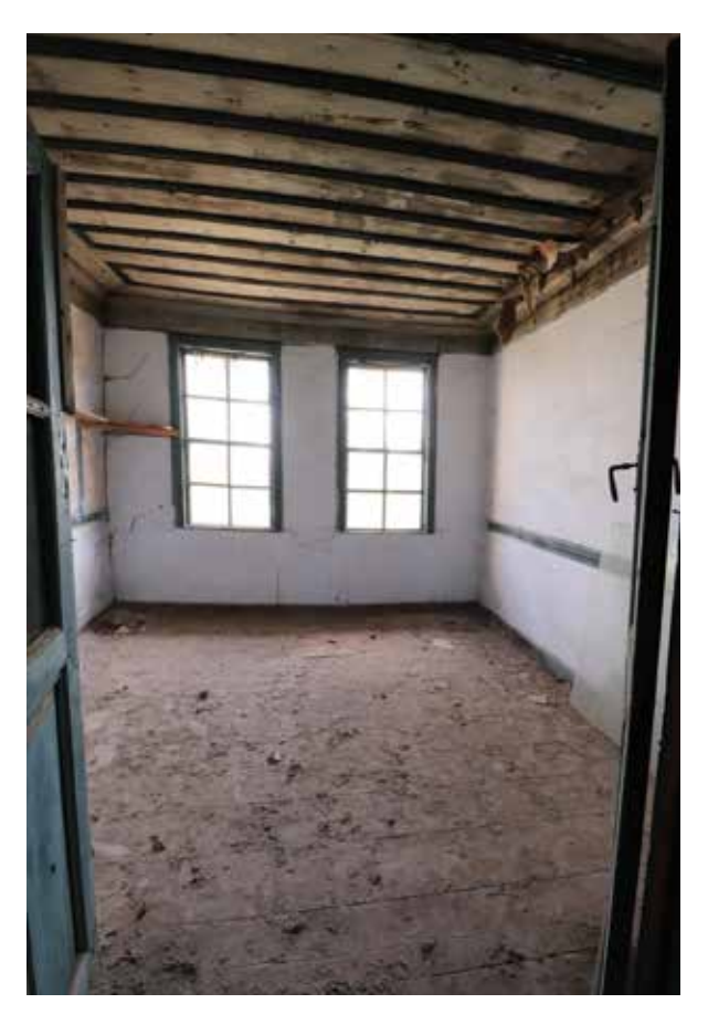
Fig. 6: Southeastern room on the first floor

The sofa on the second floor also has a rectangular plan. At the eastern end of the sofa is a window, now looking onto the adjacent building, and a sink in the southeastern corner. At the western end of the sofa, the curving staircase leads to the roof, but it is thought to have originally led to a third floor (Fig. 7). The timber ceiling of the sofa has wood lath ornamentation ( çıtakâri ). The two rooms to the south of the sofa on this floor project outwards by approximately 60 cm. This projection is carried by timber brackets. The room in the southeast is larger and has a remarkable wood lath decoration in the ceiling (Fig. 8). The circular ceiling rose and the surrounding horizontal laths are vertically articulated, contributing to the elaborateness of the ornamentation. The rooms on this floor are also plastered and painted indigo blue. The roof of the southwestern room has almost completely collapsed, which threatens the flooring due to the increased weight. There are cracks around the window openings. Among the rooms to the north of the sofa , the northwestern one is entered through a narrow, double-winged timber door, painted green. This room has a window, which was closed later. The other room is slightly smaller and has a single window that is very close to the neighbouring building. There is a wet space in the southeastern corner of this room that was added later.