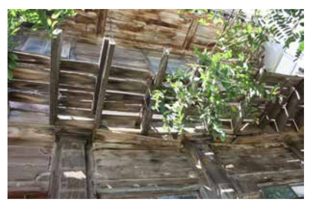
Fig. 3: Timber projection at the top level of the ground floor on the south façade

On the east façade, there is one window on the ground floor, two on the first floor, and three on the second floor. After the construction of adjacent building, these windows were blocked.