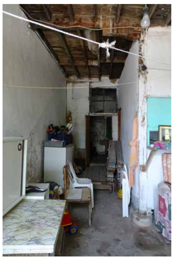
Fig. 5: The entrance hall on the ground level