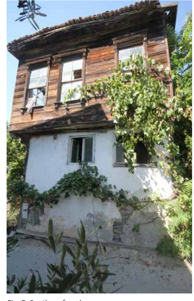
Fig. 2: Southern façade

ruinous condition, is covered with over and under tiles.