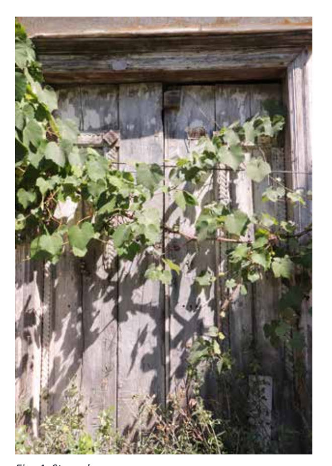
Fig. 4: Store door

openings to the south of this balcony; one of these openings is closed with cement plaster. Since the northern part of the upper floor collapsed starting at the northern edge of the balcony, the symmetrical window arrangement in this section was determined from the building's photograph in the registration document. There are three rectangular window openings on the upper level of the southern façade. These are sash windows, accentuated with timber jambs, sills, lintels, and protruding bracket-like elements.