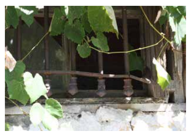
Fig. 5: The detail of the window bar at the ground floor level of the western façade

The decorations cluster around the doors and windows. There are two timber-frame mouldings on the door to the south of the western wall, arranged as two vertical rectangles constructed by gluing the timber elements together and nailing them on the door wing. Two layers of rhombuses are placed at an angle at the corners of the spiralling frame mouldings (Fig. 4). Although the windows are quite plain, the one between the two doors has iron bars that terminate in bud motifs at the bottom and as pinecones at the top, which is a rare type of ornamentation (Fig. 5).