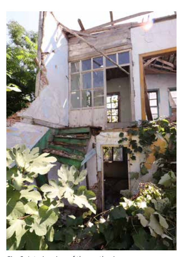
Fig. 3: Interior view of the south wing

The western and southern façades of the house facing the street have an elaborate organization (Figs. 1-2). Access into the house was provided by two doorways on the western façade - one on the central axis and the other to the south of the façade. The large, double-winged door in the south provided access to the commercial space downstairs. The main entrance to the house is from the door in the middle. Although it is narrower than the other door, it is still double-winged. The door is elevated from the street level and accessed by steps. There are two rectangular windows with double casements on the ground floor of the southern façade. The upper floor projects along the entire western and southern façades. The projection sits on a timber bracket (eliböğründe) covered by wood laths. Above the main entrance of the house on the western façade is a narrow balcony (open sofa, gezemek). There are two window