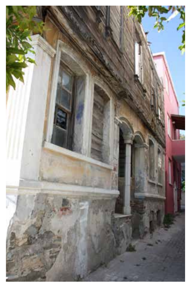
Fig. 3: Eastern façade, general view

entrance door and a rectangular, double-casement top window up to the level of the arch. There is a square window at the basement level of the eastern part of the southern façade, which was later closed by timber planks. At the ground floor level, there are two rectangular sash windows with depressed arches and profiled jambs. The upper floor projects along the entire façade. The projection is supported by timber brackets that sit on the pilaster capitals and are covered with laths. The western half of the upper floor façade is ruined. There are two rectangular windows on the eastern half of the façade. The window jambs are placed on timber elements resembling brackets at the bottom, the upper corners of which extend outwards to resemble a cross. These extending parts adjoin the lintels of these two windows. The keystones of the windows are emphasized by their protrusion.