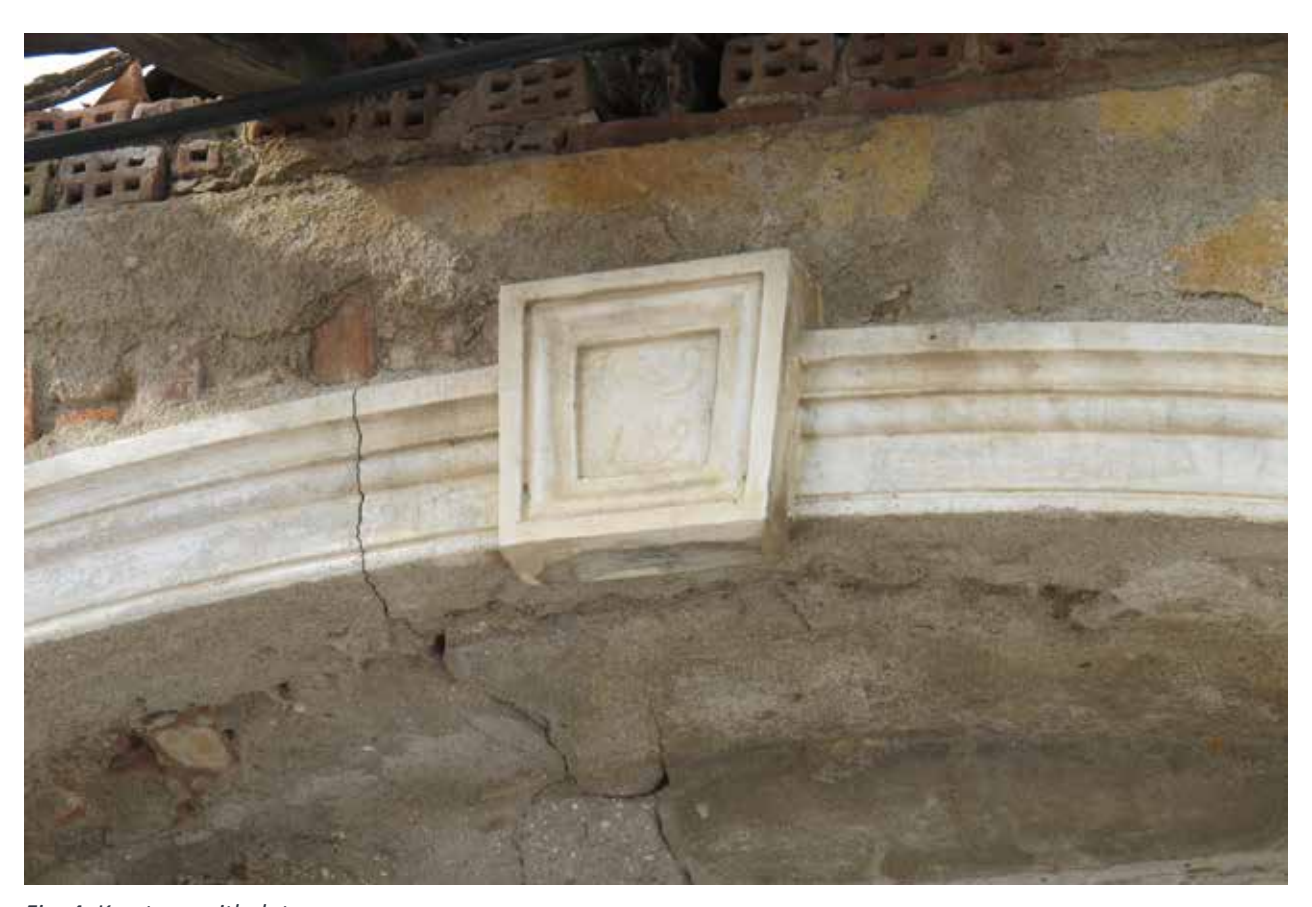
Fig. 4: Keystone with date

The entrance, which is placed on the central axis of the eastern façade, is arranged as an iwan opening outside via two depressed arches (Fig. 3). A five-step, marble staircase in the northern arch leads to a landing. The three-piece marble column is placed on the