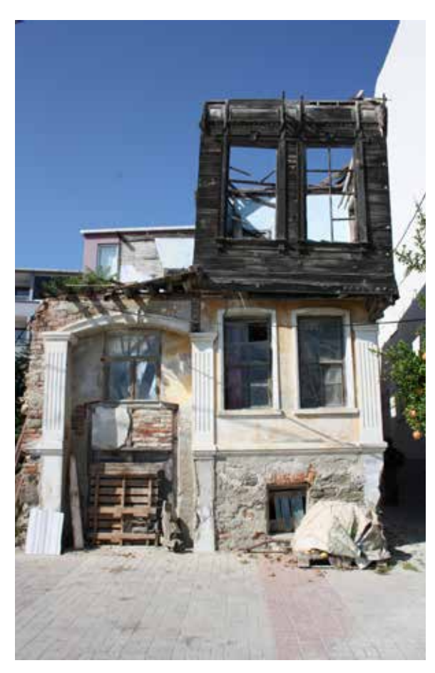
Fig. 2: Southern façade, general view

The western half of the southern façade is allocated to the entrance iwan to the upper floor level. The iwan is very shallow and framed by a depressed-arched opening that sits on square, gypsum pilasters on both sides. The eastern corner of the façade has a similar pilaster. The pilasters are divided in two by profiled mouldings, which run along the southern and eastern façades and separate the basement from the ground floor. The upper parts of these Doric pilasters are articulated with vertical grooves and have thin capitals with mouldings. The keystone of the recessed arch that sits on the capitals, protrudes outwards. These profiled mouldings are also repeated on the arch. Within the northern wall of the alcove, there is a double-winged, timber