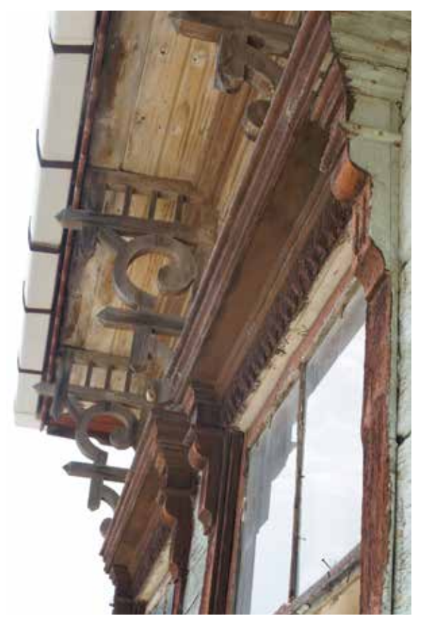
Fig. 4: Detail of eaves brackets

The northern half of both façades and the basement walls have been plastered with cement-based mortar. Timber sections of the building have deteriorated. There is significant loss of material, particularly in the brackets carrying the projections and the flooring of the balcony. The building has survived with its historic architecture and monumental aspects, despite its modest decorations.