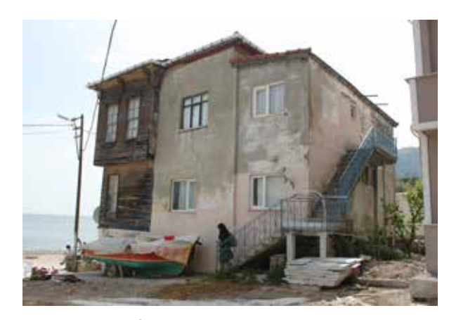
Fig. 2: Eastern façade and modern northern annex

During the division of the building into two, separate dwellings, the staircase to the north of the sofa was removed. The upper floor, which is accessed through a door on the northern façade, features four rooms flanking a rectangular inner sofa . Like the façade organization, the plan layout is symmetrical. However, the annex to the north disrupts this symmetry.