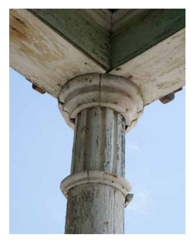
Fig. 3: Detail of a balcony post